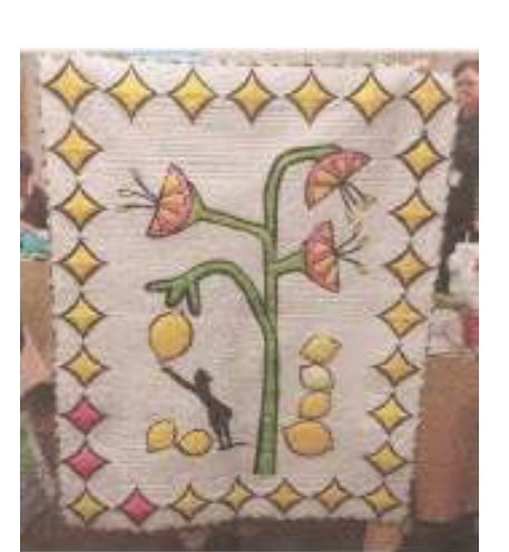
Lemon Cathedral Quilt

PROGRAM MAY 21~ "QUILTING DUCKLING TO QUILTING SWAN" WORKSHOP MAY 22~"LEMON CATHEDRAL"