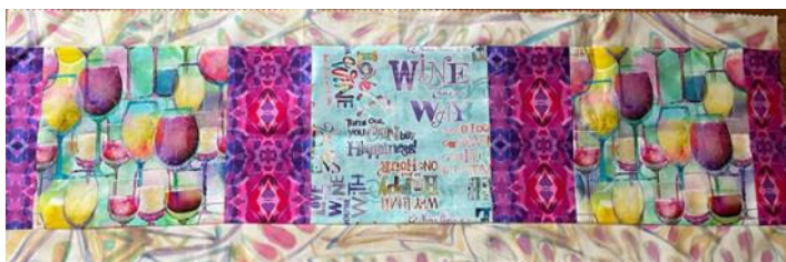
One of many Sew-a-Row starters available