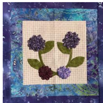
For Elaine Ramires