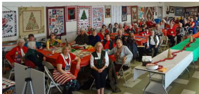
Holiday Potluck 2019