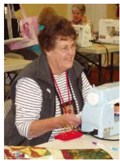
↑ Meadow Blanche→