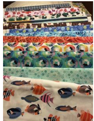
Some of the fabrics Donated by Bolt