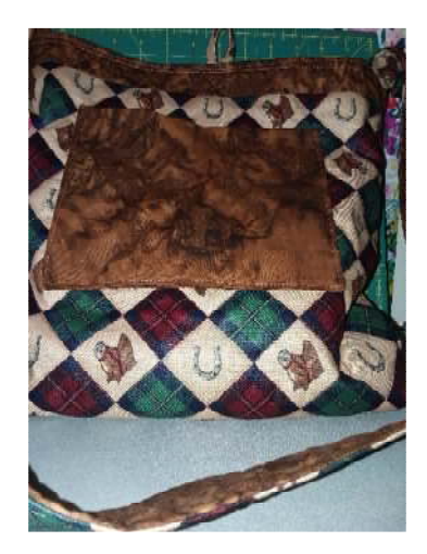
Voila! The finished bag!

Making the strap: Right sides together, pair with batting, sew, turn right side out, top stitch. Place the strap at the side seams. Sandwich the strap between the outer bag and the lining (right sides together). Top stitch closed. Don't forget to stitch up the lining.